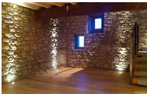
Interramento a livello terreno di insediamento perfettamente nel territorio